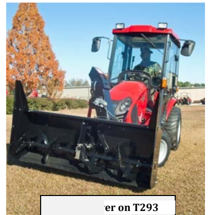
er on T293

y and of the y turns tless. nd 84” re oice of t your